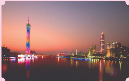
zhū jiāng 珠江 Pearl River