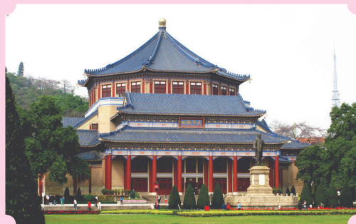
guǎng zhōu zhōng shān jì niàn táng 广州中山纪念堂 Dr. Sun Yat-sen's Memorial Hall