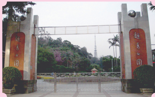
yuè xiù gōng yuán 越秀公园 Yuexiu Park