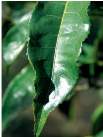
Leaves of ancient tea trees in Yibang