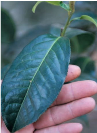
Leaves of ancient tea trees in Yiwu