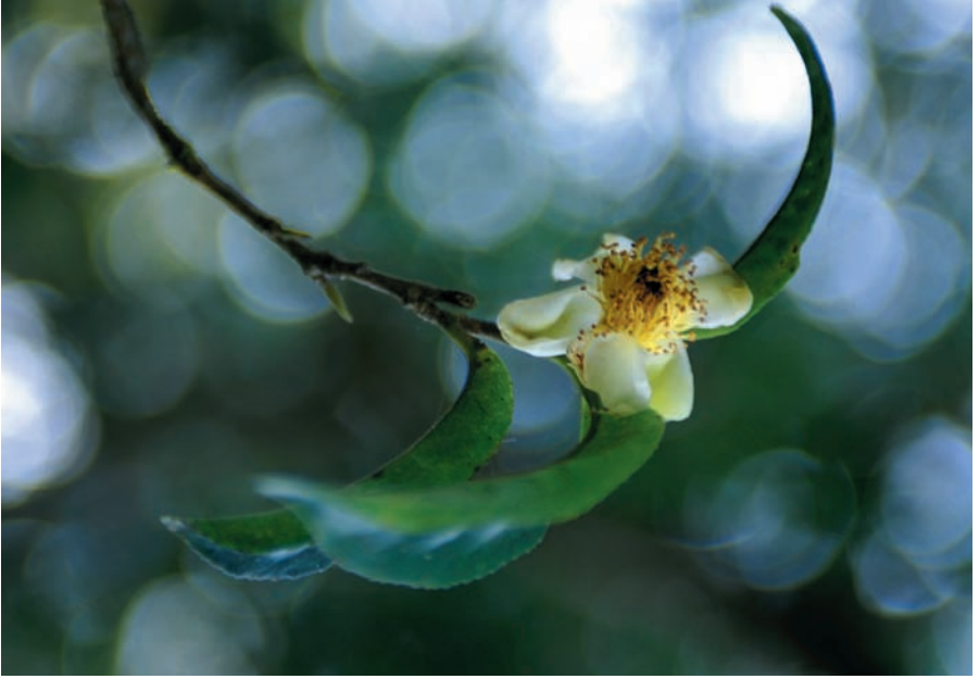
Blossoms of the ancient tea trees in Gaoshan Village of Yiwu

Where can you find ancient tea gardens but in the mountains? Unlike the tender and light green tea trees found south of the Yangtze River, tea trees here are as sturdy and high as ancient pines, with tough dark green leaves. The rough leaves reflect strength accumulated with age. The tea blossoms are as delicate as they were when the tree first budded. Amid such breathtaking surroundings, one cannot but bow in reverence.