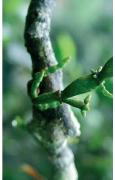
Young 20–30-year-old tea trees at the foot of ancient 400–500-year-old tea trees