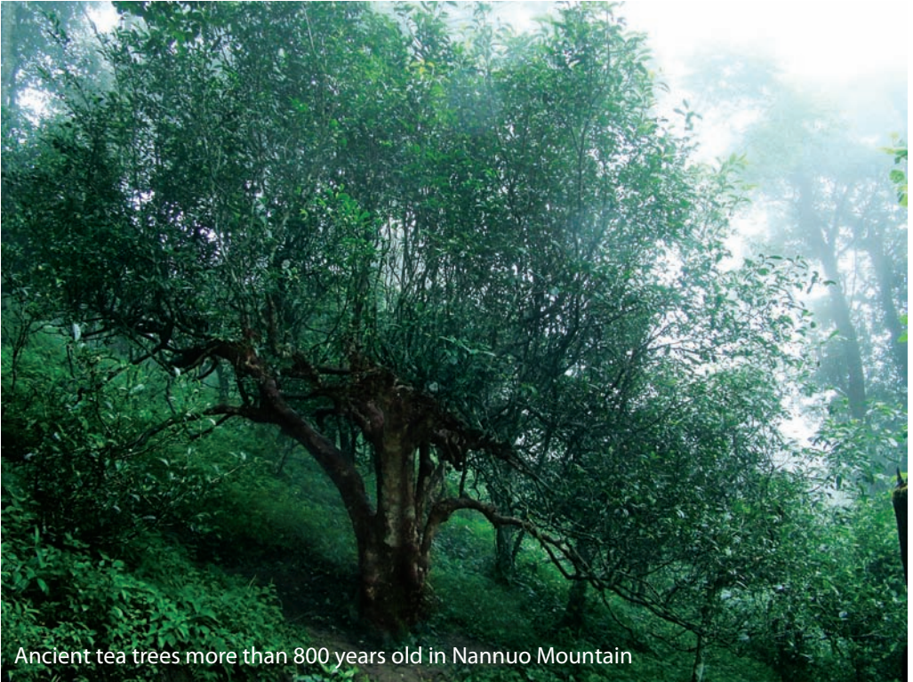
Ancient tea trees more than 800 years old in Nannuo Mountain

You have to visit the virgin forests in southwest Yunnan to see the original ancient tea trees. Oblivious to the changing market economy, these trees remain unmoved, watching the mountain fog gathering and clearing all year round. Unlike young trees which flourish every season padding the tea farmers' wallets, ancient trees slow down their growth, showing dignity. The phrase "tea from wild ancient trees" touches your heart, transporting you to the vast fields and remote mountains, offering tranquility.