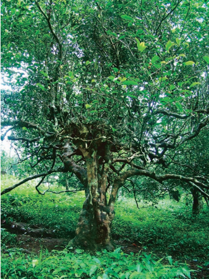
King of tea trees in Nannuo Mountain