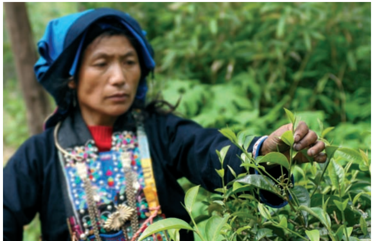
A Hani tea farmer of Bangzha Community in Pu-erh