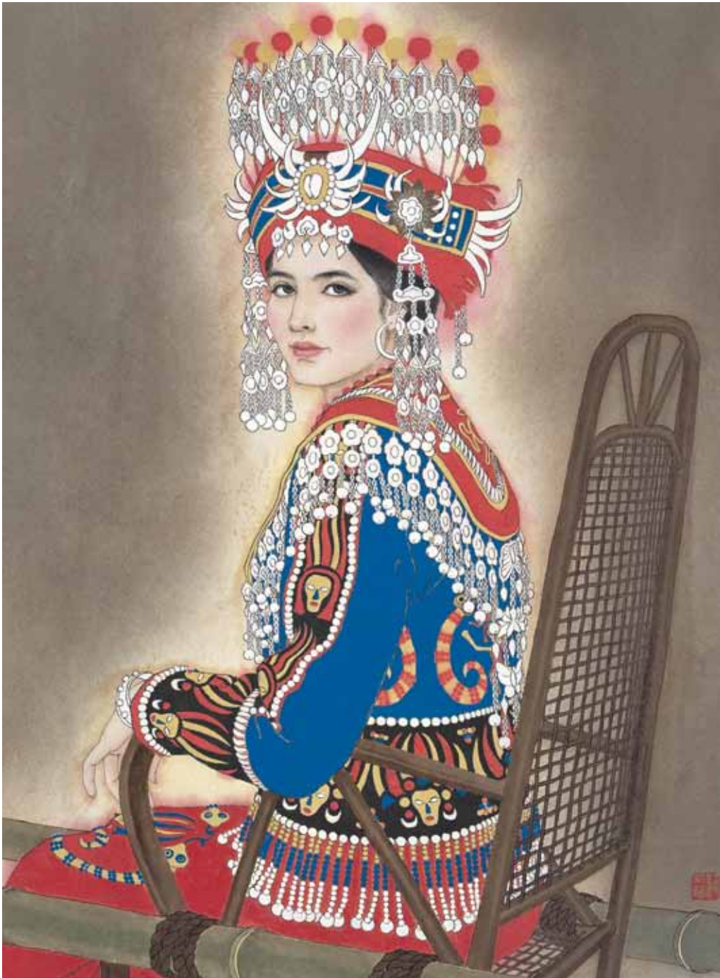
Portrait of a Bride of Taiwan's Paiwan Nationality