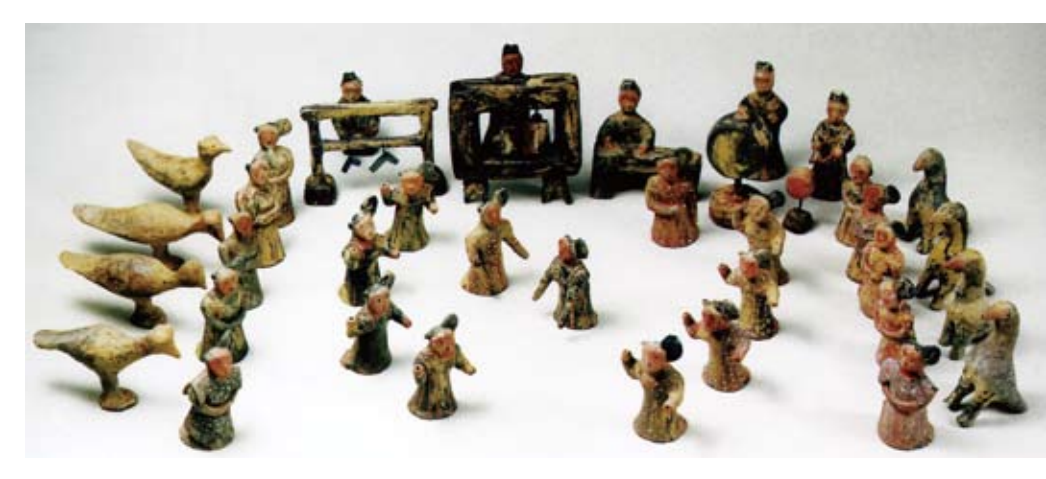
Figurines of performers and dancers excavated from a tomb of the Warring States Period in Zhangqiu, Shandong Province, show a grand performance scene.

inscriptions on the unearthed bronze ge show that marquises of the State of Zeng were formerly from a branch of the King of the Zhou Dynasty. The 65-piece chime bell discovered in the tomb of Marquis Yi is the most complete and biggest bronze chime bell known so far. Chimes appeared as early as the Shang Dynasty, with three to five bells at first, nine to 13 in the Zhou Dynasty and 61 in the Warring States Period. Based on sizes, sounds and ranges, bells were arranged into chimes to play pleasant and melodious music.