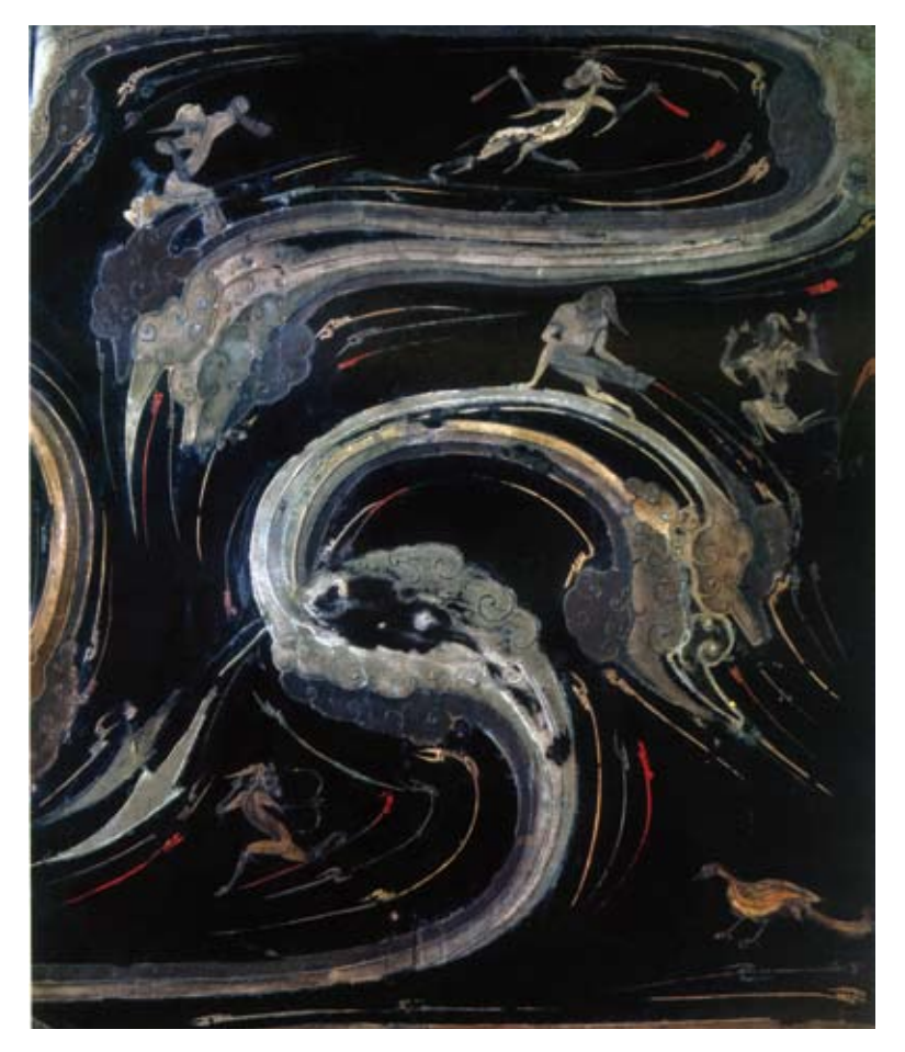
Painting of Performing, Singing and Dancing Gods unearthed from a painted coffin from tombs of the Western Han Dynasty at Mawangdui.

ethnic groups in various areas, including Beidi and in remote areas like the western regions. Therefore, music like Shen Lai Yan Yi (Entertaining the gods when they came) and Cheng Xuan Si Long (Riding on dragons) from Anshi Fangzhong Yue ( The Boudoir Poetry of the Peaceful Age ), and Jiaosi Yue ( Rural Sacrificial Music ) accompanied by a magnificently-dressed witch who was singing while dancing gracefully in the moonlight, and could be heard