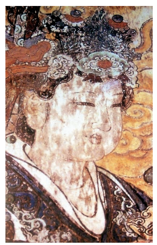
Jade Lady, from wall painting of the Yongle Palace, Yuan Dynasty (1271 – 1368)