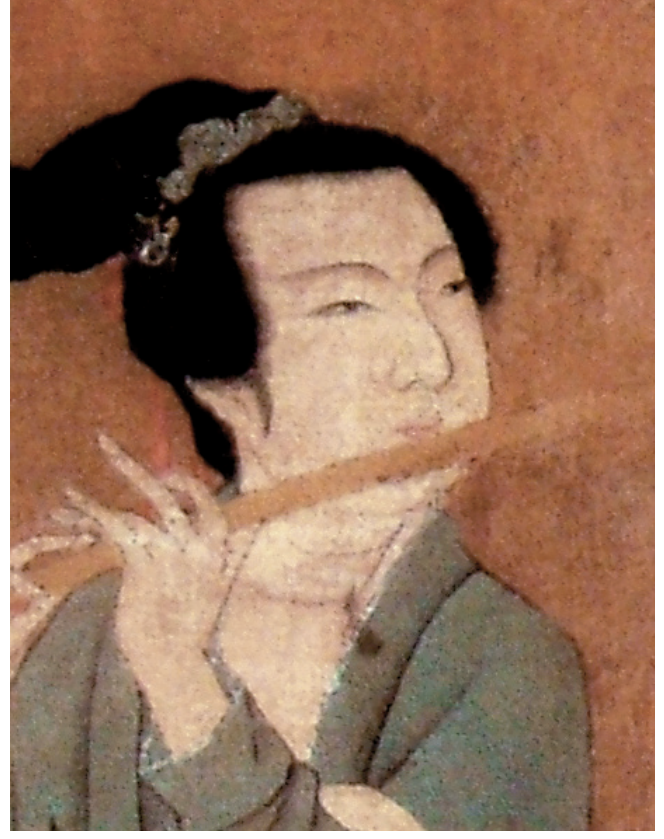
Han Xizai's Nightly Feast (detail) by Gu Hongzhong (10th century)